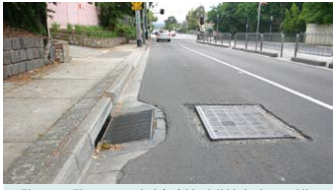
Figure 2 – The groove to the left of this pit lid is in the travel line for cyclists and poses a serious risk

Most cyclists prefer to ride on asphalt or concrete surfaces that are free from cracks and potholes. On spray sealed surfaces, cyclists prefer an aggregate size of 10 mm or less and surfaces that have had minimal crack sealing undertaken.