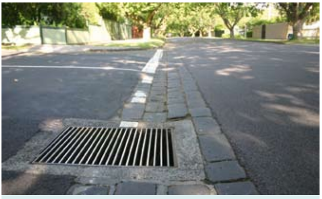
Figure 1 – Drainage grates with bars parallel to the direction of travel pose a serious risk to cyclists

In fact, cyclists have indicated that surface quality is twice as important as traffic volumes and the availability of bicycle facilities on their choice of route.