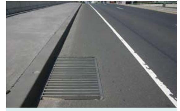
Figure 3 – Drainage grate with perpendicular bars in bicycle lane on La Trobe Street, Melbourne

Clearly, the purpose of drainage grates is to drain water from the kerb and channel into the storm water drainage system. Since the water is travelling parallel to the direction of travel, drainage grates with bars parallel to the direction of travel are likely to facilitate a higher flow rate than those with perpendicular bars.