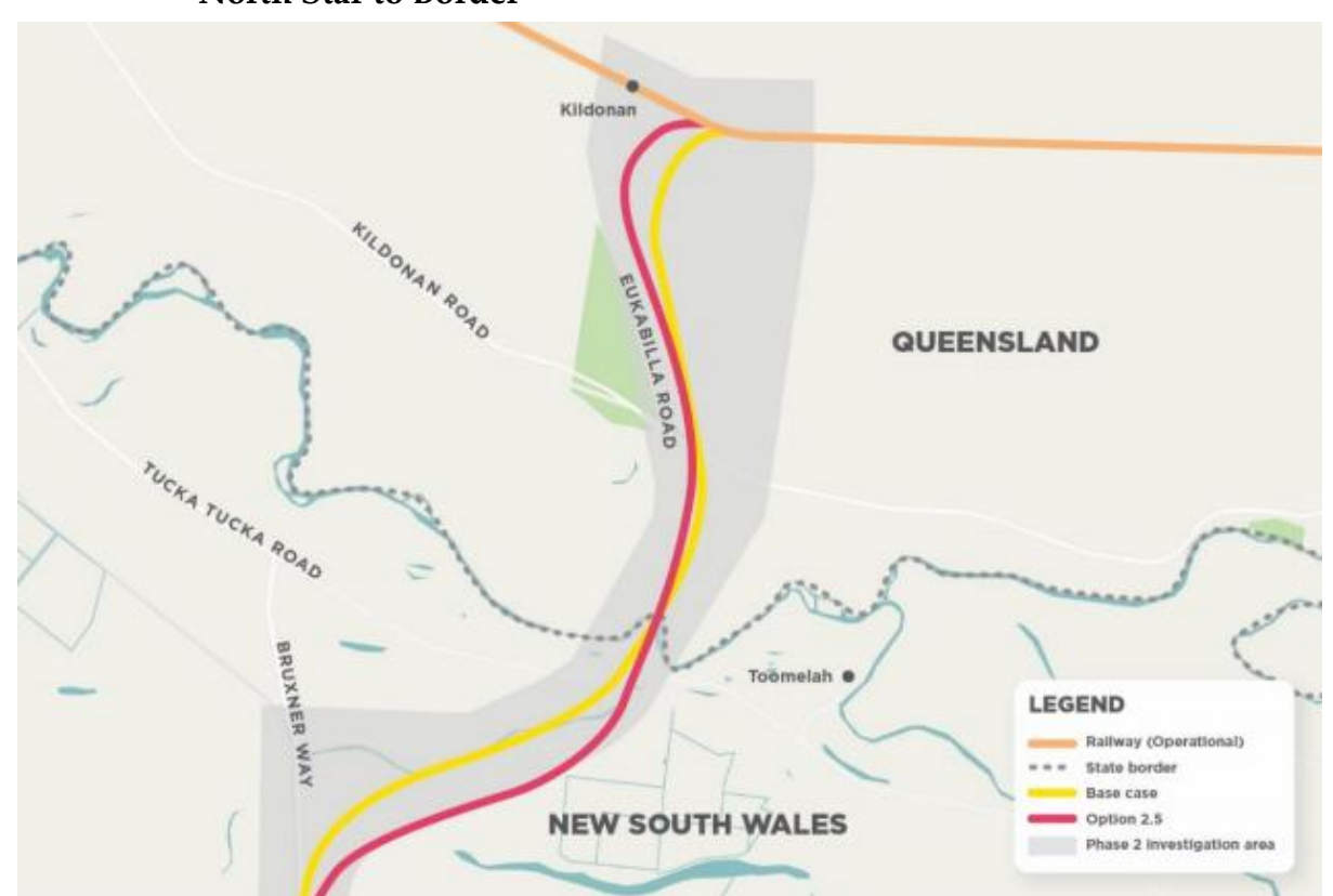
Figure 6.2 Inland Rail, EIS preferred alignment—Macintyre River crossing, North Star to Border

The ARTC's preferred alignment for phase 2 feasibility design is below, extracted from the ARTC's NS2B draft EIS document.<sup>11</sup>